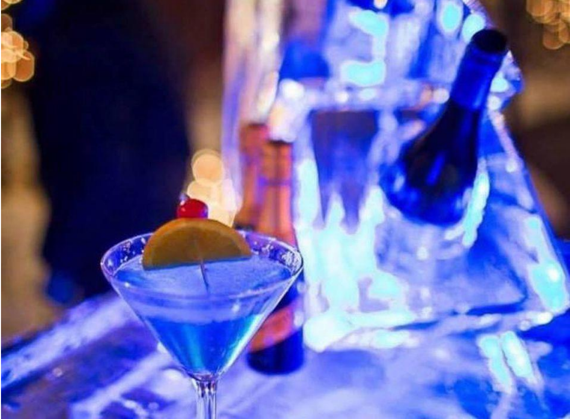
The Fire + Ice Bar at Hotel Viking is an outdoor bar made of ice, with fire pits and flaming cocktails

chocolate bar has white, dark and milk chocolate variations on hot chocolate, with spirits or not, topped with cookies and macarons made by the four-star restaurant's pastry chefs.