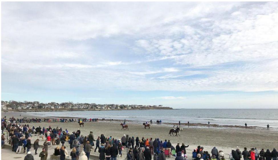
Newport Beach Polo, played in the sand on First Beach, happens February 23-24

From February 15-24, the seaside summer playground becomes a winter wonderland, with 150 events ranging from concerts and kids performances to live ice sculpture demonstrations, ice skating and outdoor ice bars. This is the 31st year of the festival, which draws thousands of people to the City By The Sea, normally a popular warm weather destination that becomes much quieter in the winter months.