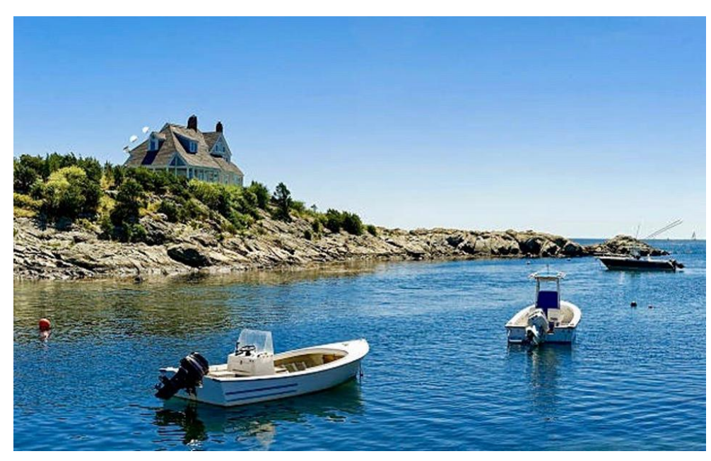
Newport, Rhode Island is a boating enthusiast's dream

One of the oldest resort towns in America, Newport, Rhode Island, is known as the Sailing Capital of the World and as the Queen of Summer Resorts. Yet, there is more to Newport, Rhode Island than meets the eye—though, of course, what greets you when you cross the Pell Bridge is endlessly appealing to all of the senses. A mere 4-hour drive from New York City and an hour and a half from Boston, this seaside city along the southern tip of Aquidneck Island has long been a favored weekend getaway for urban travelers hailing from the East Coast.