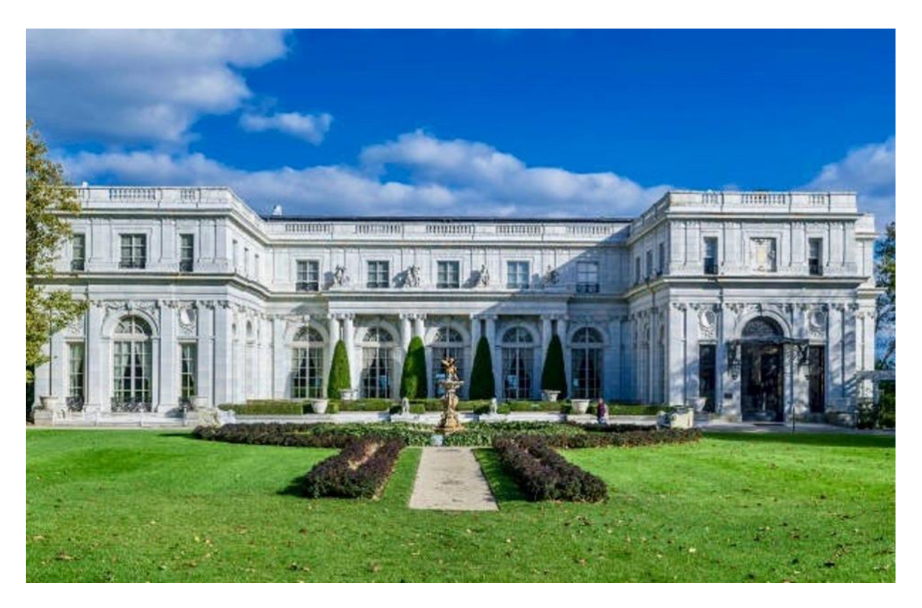
Rosecliff was the setting of the Grace Kelly film 'High Society'

One of the oldest resort towns in America, Newport, Rhode Island, is known as the Sailing Capital of the World and as the Queen of Summer Resorts. Yet, there is more to Newport, Rhode Island than meets the eye—though, of course, what greets you when you cross the Pell Bridge is endlessly appealing to all of the senses. A mere 4-hour drive from New York City and an hour and a half from Boston, this seaside city along the southern tip of Aquidneck Island has long been a favored weekend getaway for urban travelers hailing from the East Coast.