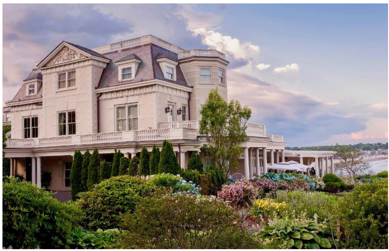
The exterior of the Chanler THE CHANLER

Travelers looking to be removed from their daily lives—and awakened to the struggles of how life was lived in another time—should consider booking a stay at the Rose Island Lighthouse. This lighthouse is set upon an 18-acre island located one mile off Narragansett Bay—just book quickly: There are only five rooms available in total.