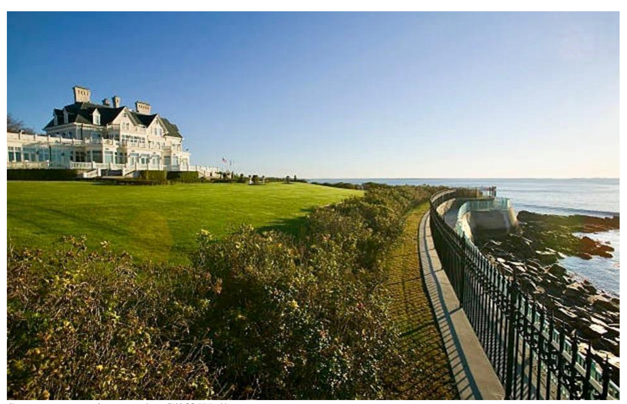
Summer mansion on the Cliff Walk

Visitors can enjoy both the beach and the event in the summertime, as well, of course: Newport Polo is a classic afternoon activity, while Sachuest Beach (locally referred to as "Second Beach") is a known surfer hangout, and is the most social of Newport's public beaches—owing, perhaps in no small part, to the Dell's Lemonade truck. The beverage is a Rhode Island staple—but more on Newport cuisine in a bit.