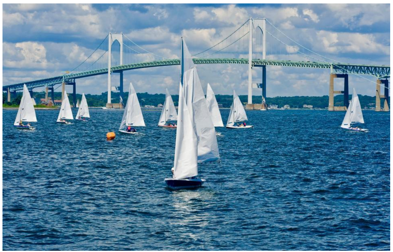
Sailboats Everywhere

Driving remains the only direct method for reaching this seaside town. Travelers escaping New York City should consider the journey part of the vacation. Trading a decades-old Jeep Cherokee for a brand-new Lincoln Nautilus made the Friday afternoon traffic far more manageable. When arriving in the town that's the setting for High Society , why not make your entrance in style? So, go ahead: splurge on that business class ticket or Black Label luxury. It's all about attitude, after all.