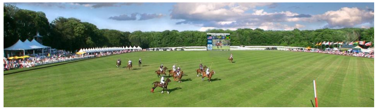
A match is in session NEWPORT POLO

Curious travelers should consider signing up for a tour of these iconic estates—we personally recommend exploring the interior of The Elms or The Breakers, though the grounds of Rosecliff (the setting of the Grace Kelly film, High Society ) are the most breathtaking. Travelers visiting in the fall should purchase tickets to the Newport Wine & Food Festival, which will be held from September 19th to 22nd at The Elms, Rosecliff, and Marble House.