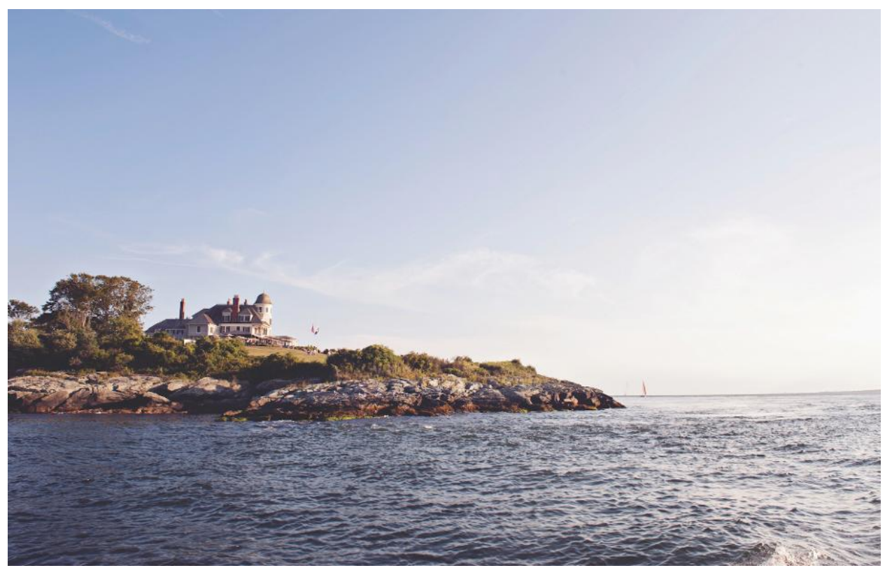
View of the Castle Hill Inn from the water CASTLE HILL INN

nationwide. And planning your Ocean State revelries needn't be restricted to travel in the summer months. Why not visit in the shoulder season, when the water remains warm (and the prices start to cool) in the fall? Or the wintertime, when Snow Polo and Gilded Age Christmas festivities beckon? From decadent mansions to breathtaking cliff walks, read on for your guide to Newport, Rhode Island.