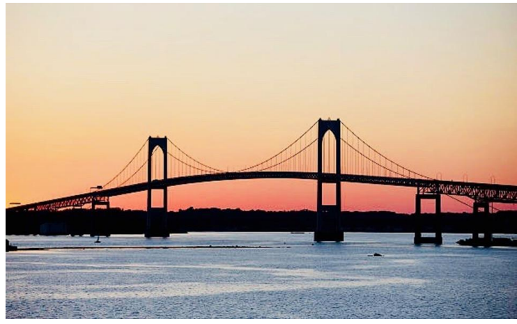
The Claiborne Pell Bridge, Newport, RI

Visitors looking for a more low-key night should visit the IYAC (the International Yacht & Athletic Club). The tiny bar is a favorite amongst old salts: Sailors who don't feel like throwing on a collared shirt. Be ready for a crowd with many stories to tell—as the sailing capital of the world, Newport draws a broad array of seafarers and explorers. (And now: You, too, as well).