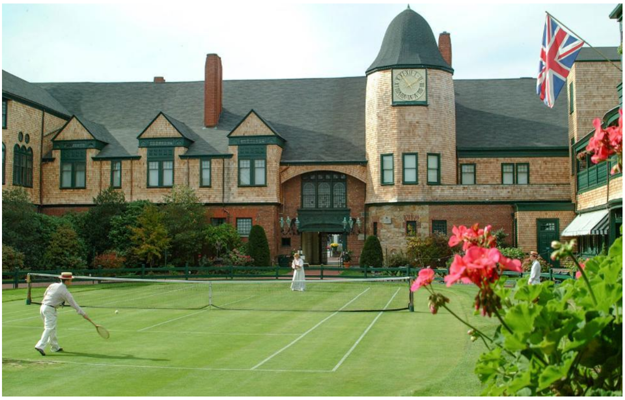
International Tennis Hall of Fame VISIT RHODE ISLAND