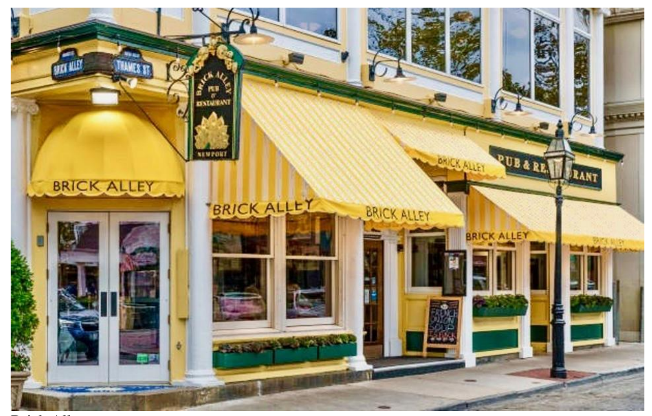
Brick Alley