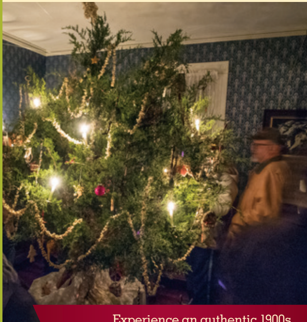
Experience an authentic 1900s farmhouse Christmas, complete with Christmas Tree lighting and treats.