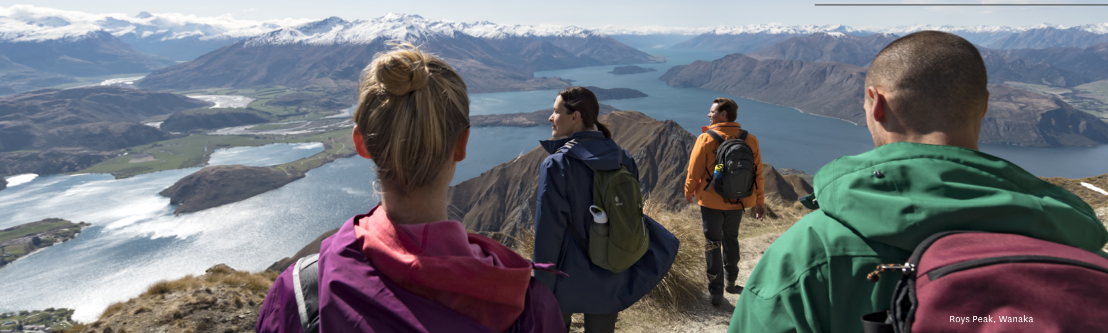
Roys Peak, Wanaka