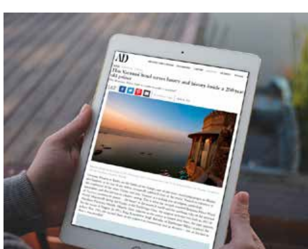
ARCHITECTURAL DIGEST GIVES US A THUMBS UP!