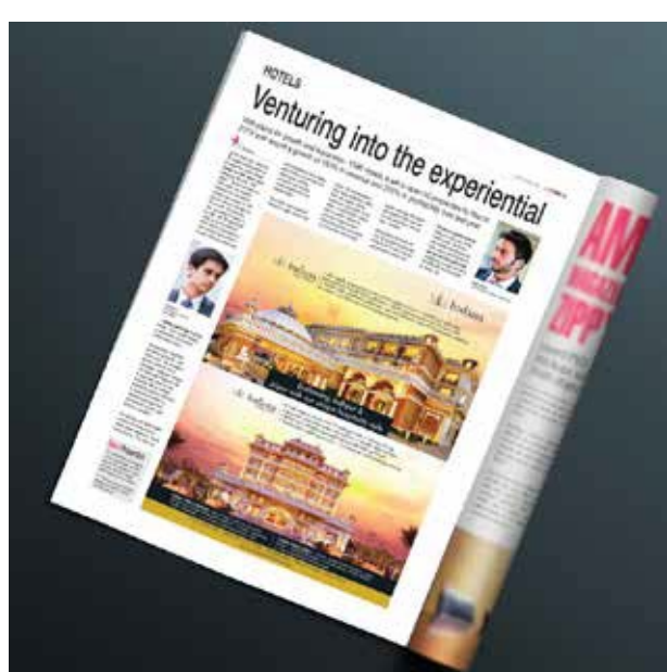
1589 HOTELS FEATURED IN TRAVEL TALK