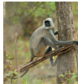
Clockwise from top: a leopard; an Indian langur; crested serpent eagle; and a baby blackbuck who seems chummy with this employee of the Satpura sanctuary