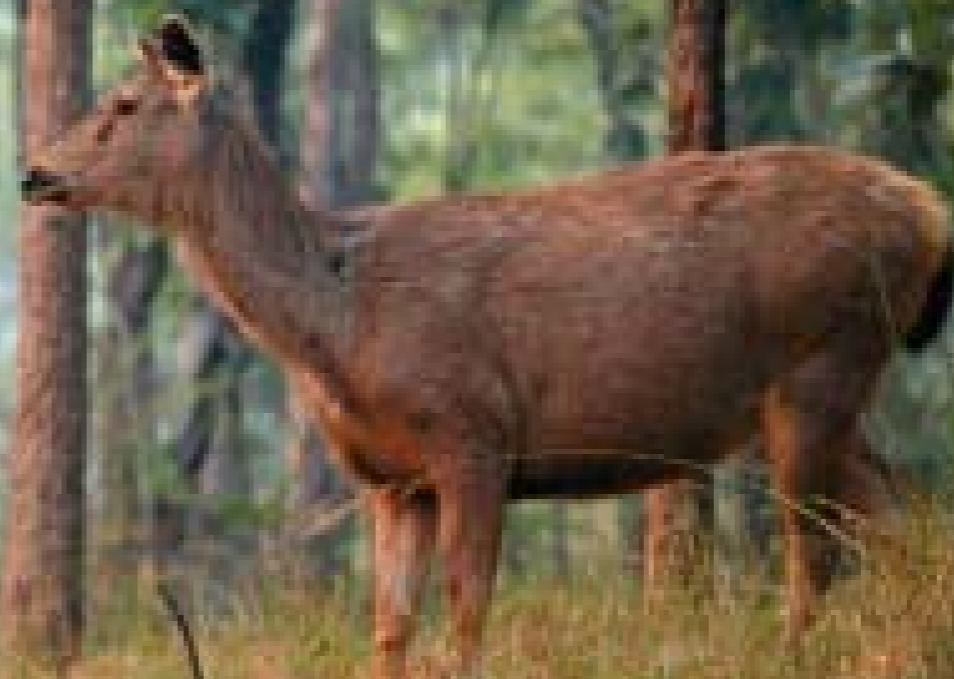
Clockwise from this picture: a female sambar in Satpura National Park; a waterbody in the park's core area; and tourists on an elephant safari