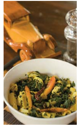
Palak paneer is one of the homey dishes at mealtime; and (left) a bush dinner and barbecue, a Reni Pani speciality