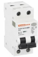
Residual current circuit breakers (RCCB) with overcurrent protection P1RE 1P+N 2 IEC