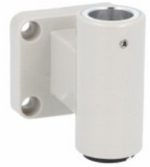
Signal tower Ø50mm/1.97" LTN50