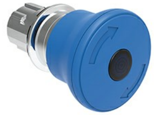
Illuminated mushroom head button actuators - Latch, turn to release Ø 40mm/1.6" LPSBL66