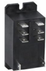
INDUSTRIAL RELAYS ATEX HR802C