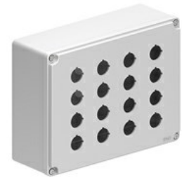
Enclosures with cut-outs for Ø22mm units - with multiholes for 16 actuators LPZM