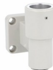
Signal tower Ø70mm/2.75" LTN70