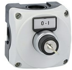
Grey control station LPZP1A8 complete with key selector lpcs320 1NO and label holder with label "o-i" LPZP1B8301