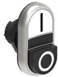
Double-touch actuators, spring return - One extended and one flush pushbuttons LPCB72