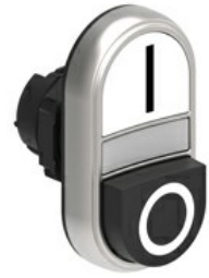
Double-touch actuators, spring return white indicator - One extended and one flush pushbuttons LPCBL72