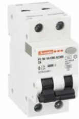
Residual current circuit breakers (RCCB) with overcurrent protection P1RE 1P+N 2 IEC