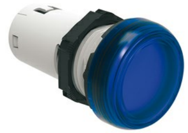
LED integrated monoblock pilot lights steady light LPML