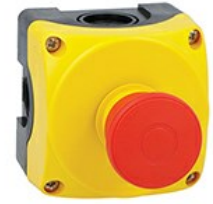
Yellow control station LPZP1A5 complete with mushroom pushbutton pull-to-release LPCB6744 2NC LPZP1B5609