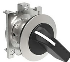
Selector switch actuators long lever - 2 position LPFS22