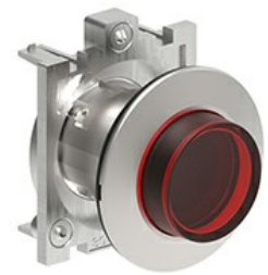
Illuminated button actuators, spring return - Extended LPFBL20