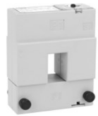
Current transformers DM0TA0150