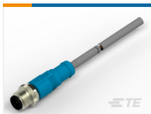
TE Part # 1SET312859R0000 M12-MS-5P-PUR-3.0