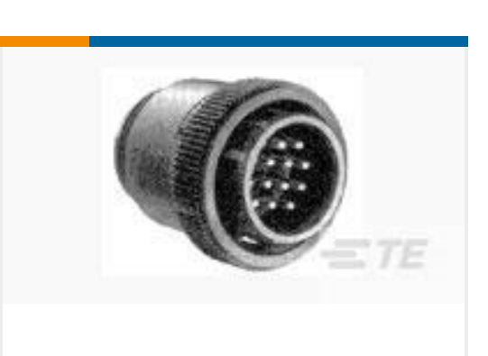
TE Part #66103-4 III+ PIN,24-20,30AU/FL,LP