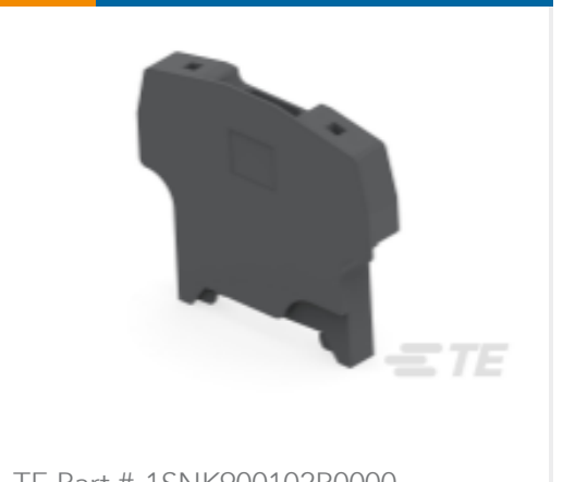
TE Part # 1SNK900102R0000 BAZH1