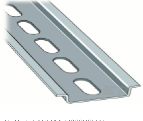
TE Part # 1SNA173220R0500 PR30