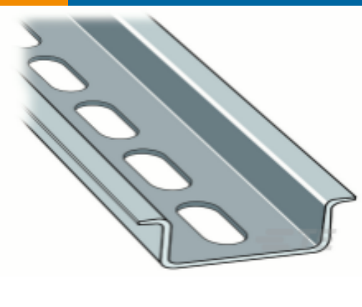
TE Part # 1SNA178529R0400 PR50