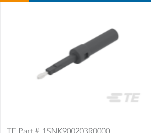
TE Part # 1SNK900203R0000 TP2