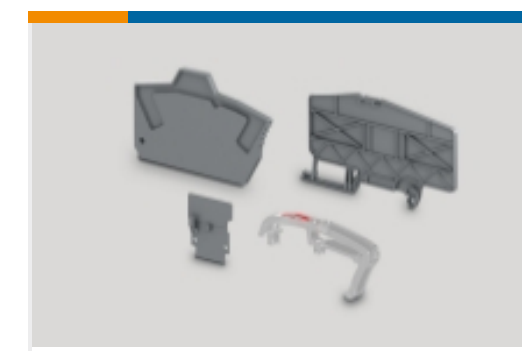
Terminal Block & Strip Insulating Accessories(30)