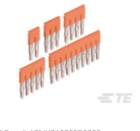
TE Part # 1SNK910305R0000 JB10-5