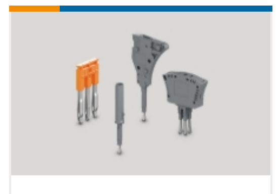
Terminal Block & Strip Conducting Accessories(67)