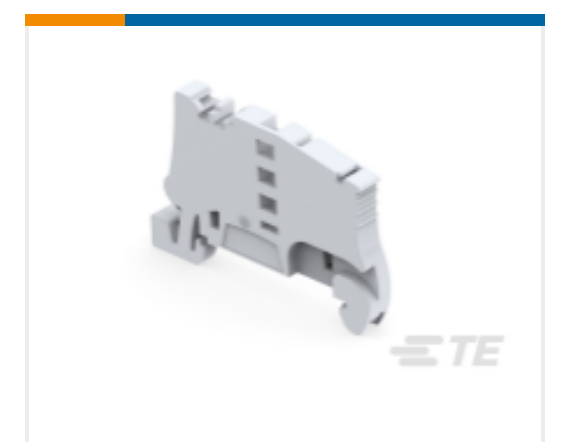
TE Part # 1SNK900002R0000 BAZ1