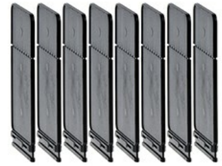
Phase barrier GLX9

Product designation Product type designation