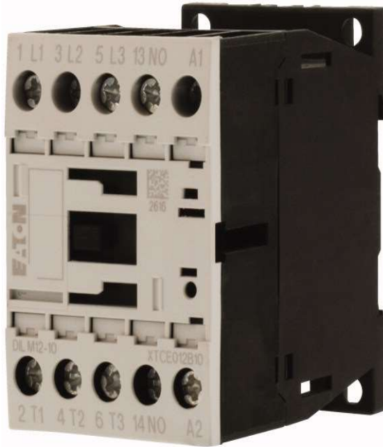
Contactor (DIL Frame 1 AC)