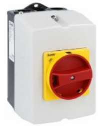
Surface mount enclosures IP65 (4X) for SM1R SM1Z Surface mount enclosures IP65 (4X) for SM1R SM1R...