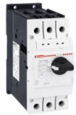
Motor protection circuit breaker SM2R