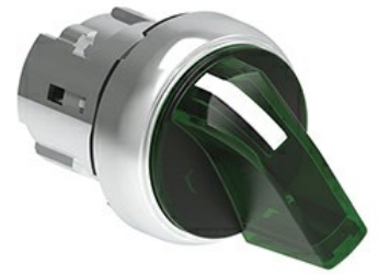
Illuminated selector switch actuator - 3 position LPSSL13