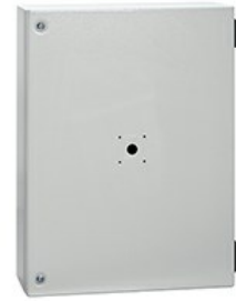
Empty metal enclosures GAZM