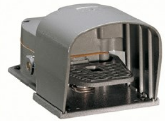
One pedal, with free actuation - with cover KR200