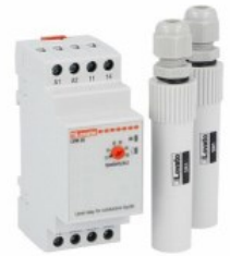
Level control relay for emptying function. Single voltage. Modular version - KIT LVMKIT20 Emptying