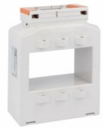
Current transformers DM37T3000 Solid-core