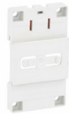
Vertical accessory for battery charger