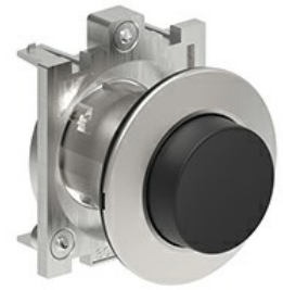
Pushbutton actuator, spring return LPFB20