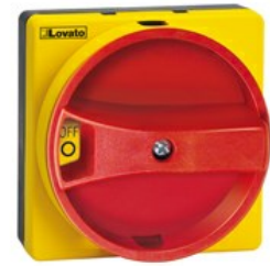
Handles for switch disconnecter GAX6