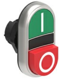
Double-touch actuators, spring return - One extended and one flush pushbuttons LPCB72