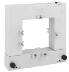
Current transformers DM2TA0300 Split-core