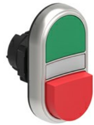
Double-touch actuators, spring return white indicator - One extended and one flush pushbuttons LPCBL72