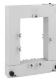
Current transformers DM3TA1500 Split-core