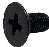
M4 SCREW x 20