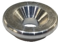
SMALL DIAMETER BUTTON x 20