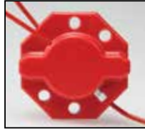
Cinch closed position with holes aligned.

Run the cable through various devices; then, with a quick twist of the hasp, cinch the cable to prevent unauthorized access.