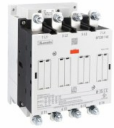
Power contactor BF230