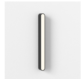
CODE: 1440005 FINISH: MATT BLACK

To maintain this product to its best condition, please view our care and cleaning guide on the support section of the astro website.