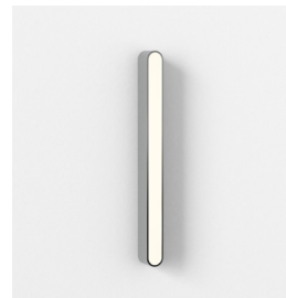
CODE: 1440001 FINISH: POLISHED CHROME