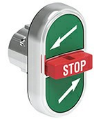
Triple-touch actuators, spring return - One middle extended buttons LPSB73