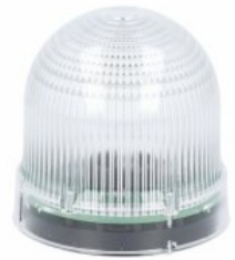
Signal beacons Ø62mm/2.44" 8LB6EL