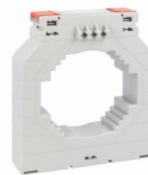
Current transformers DM4T1600 Solid-core