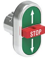
Triple-touch actuators, spring return - One middle extended buttons LPSB73