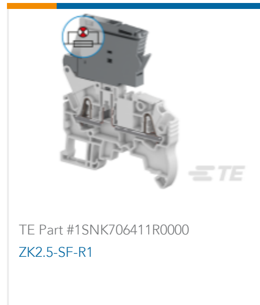
TE Part #1SNK706411R0000 ZK2.5-SF-R1