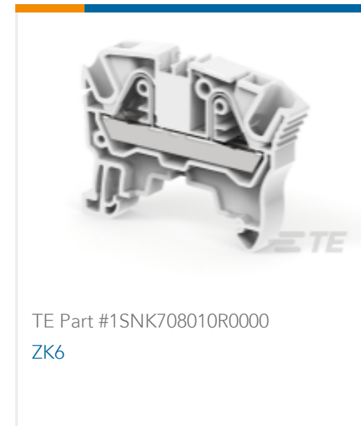
TE Part #1SNK708010R0000 ZK6