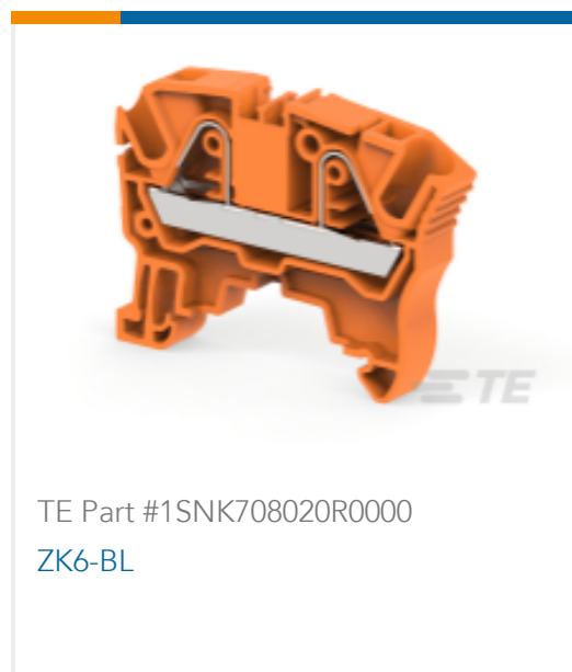
TE Part #1SNK708020R0000 ZK6-BL