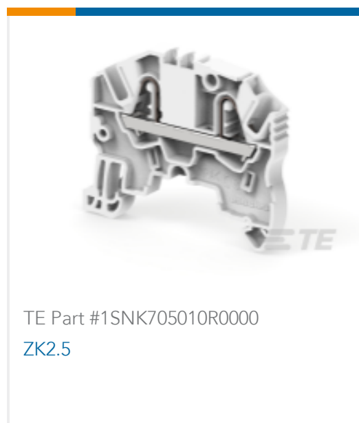
TE Part #1SNK705010R0000 ZK2.5