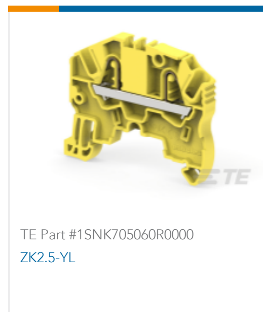
TE Part #1SNK705060R0000 ZK2.5-YL