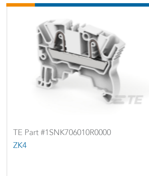
TE Part #1SNK706010R0000 ZK4