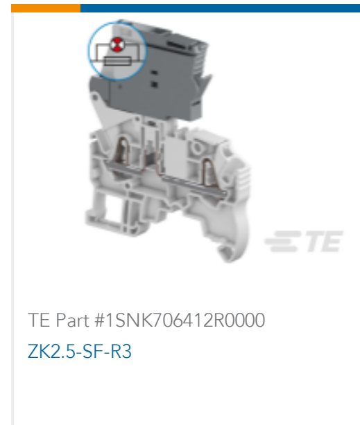
TE Part #1SNK706412R0000 ZK2.5-SF-R3