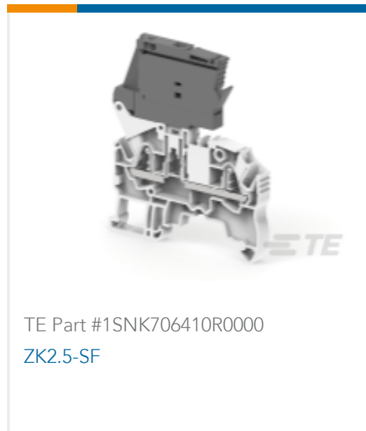
TE Part #1SNK706410R0000 ZK2.5-SF