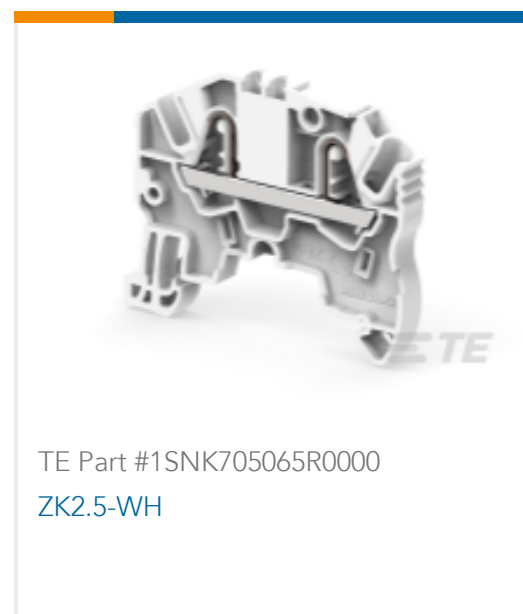
TE Part #1SNK705065R0000 ZK2.5-WH