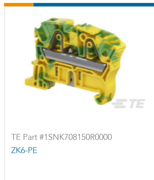
TE Part #1SNK708150R0000 ZK6-PE