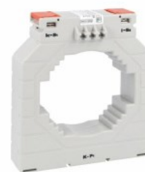
Current transformers DM4T1000 Solid-core