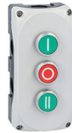
Grey control station LPZP3A8 complete with green flush pushbutton "i" LPCB1113 1NO, red flush pushbutton "o" LPCB1104 1NC and green flush pushbutton "ii" LPCB1123 1NO LPZP3B8902